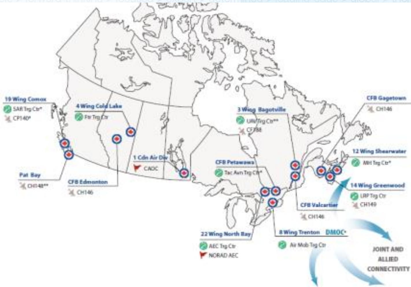
A Network of Training Nodes